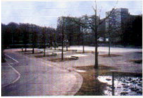
The courtyard (before)