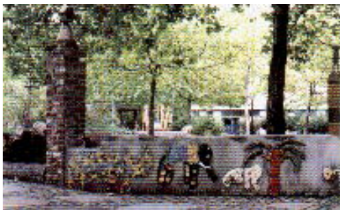
Wall mosaic (work by children)