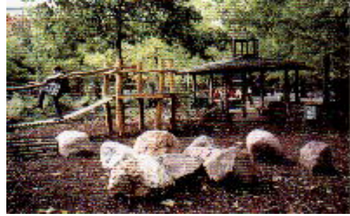
The courtyard (after)