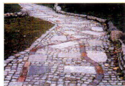
Ways out of recycled bricks from old buildings