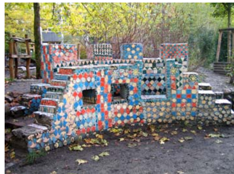
Wall with mosaic (6. class project)