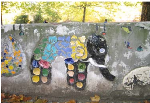
Wall ornament (work by children)